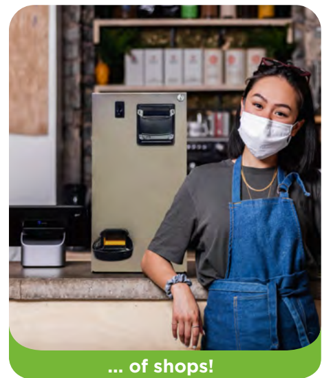
... of shops!