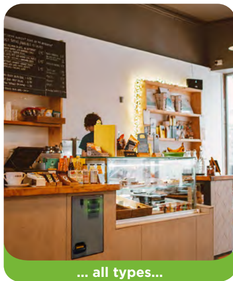
... all types...