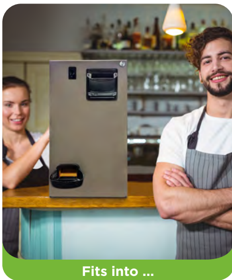
Fits into ...