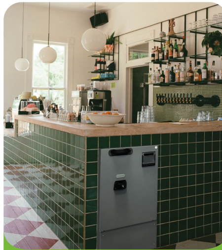
Installation with stack-stand