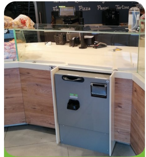
For all stores